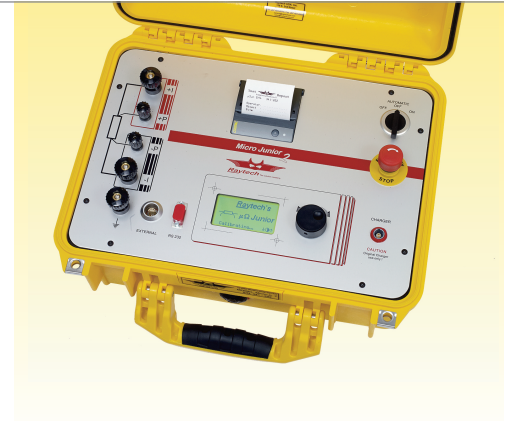
Micro Junior 2

Pure, filtered DC power source for the highest accuracy readings Complete automatic calibration system and system diagnostics Automatic measurements of resistance from 0.00μΩ ... 400kΩ Microprocessor-based system with internal storage for over 2,000 test results Single or continuous measurements with automatic data storage Preset a number of tests, at various timed intervals, for automatic data storage Automatic current reversal mode for highest accuracy Cable length correction for Cable Manufacturer Internal printer Printing and storing of test results while the test system is measuring Lithium-Ion Battery power source Standard RS-232 (serial) interface Runs for more than 5 hours continuously at 10 amps Single push button operation Response time less than 2 seconds LCD display screen with back light 5-Year standard warranty